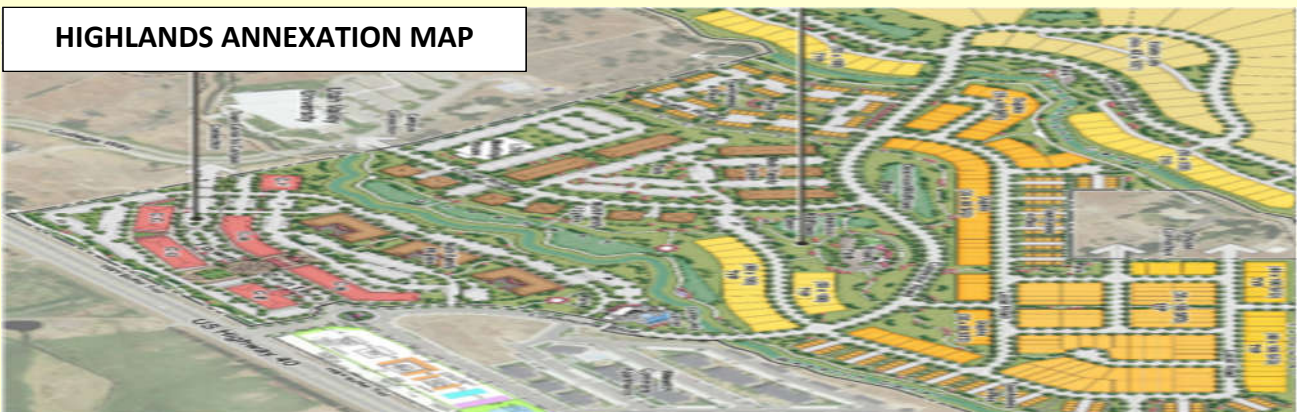
HIGHLANDS ANNEXATION MAP

https://heberut.gov/256/Agendas-and-Minutes